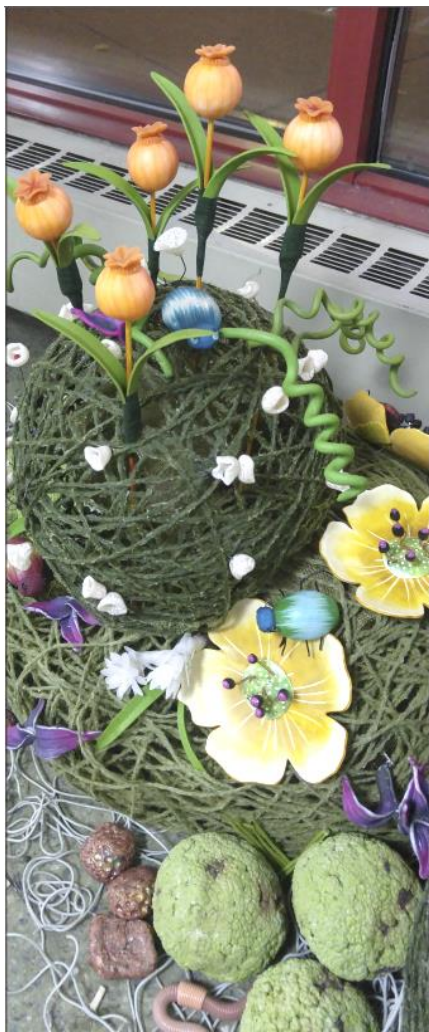
The Meadow (detail), polymer clay, mixed media